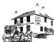
The Swan Inn & Post Horses