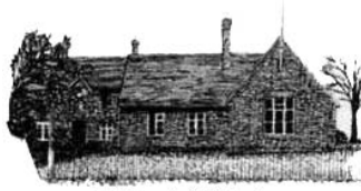
Ashington C of E School