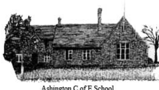
Ashington C of E School