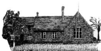
Ashington C of E School