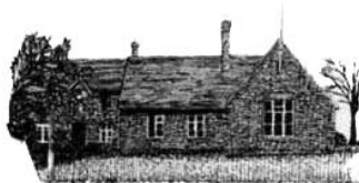
Ashington C of E School