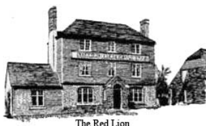
The Red Lion

The Parish Plan has been separated into the themes of the Horsham District Community Strategy, which seeks to improve the economic, social and environmental well-being of the local area and to contribute to achieving sustainable development.