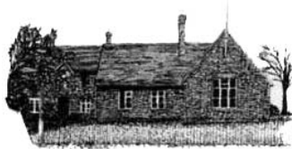
Ashington C of E School