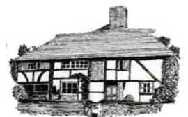
Church Farm Farmhouse