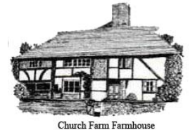
Church Farm Farmhouse