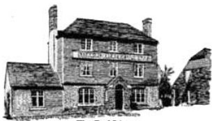
The Red Lion