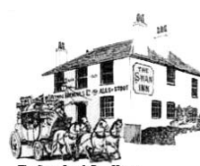
The Swan Inn & Post Horses