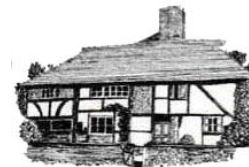
Church Farm Farmhouse