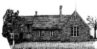
Ashington C of E School