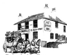
The Swan Inn & Post Horses