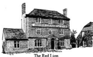
The Red Lion