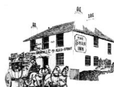
The Swan Inn & Post Horses