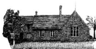
Ashington C of E School