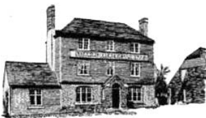
The Red Lion

www.galeodesigns.co.uk gareth@galeodesigns.co.uk Tel: 0870 8636100