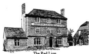
The Red Lion