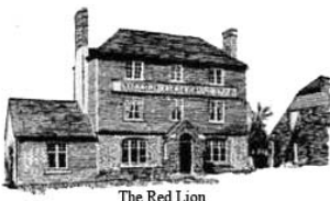
The Red Lion

Copies of this document were sent to every household in the village during late November/early December 2006. Copies are also available to read in the Co-op, Post Office, Ashington Community Centre, Ashington Youth Club, Parish Church, Methodist Church, The Red Lion and Ashington Social Club. A copy is also available on the Ashington Parish Council website www.ashingtonpc.org.uk .