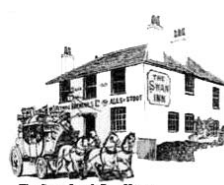
The Swan Inn & Post Horses