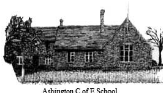
Ashington C of E School