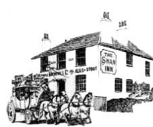
The Swan Inn & Post Horses