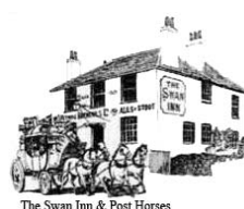
The Swan Inn & Post Horses